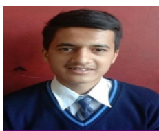
90% (2021-2022) SAKSHAM