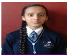
94% (2021-2022) SAMAYARA