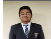
92% (2022-2023) HARS RAJ