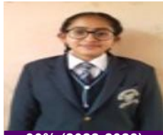
90% (2022-2023) JIGYASA