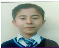
90% (2021-2022) NITTIN